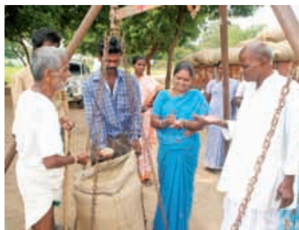
Empowered women hold their own